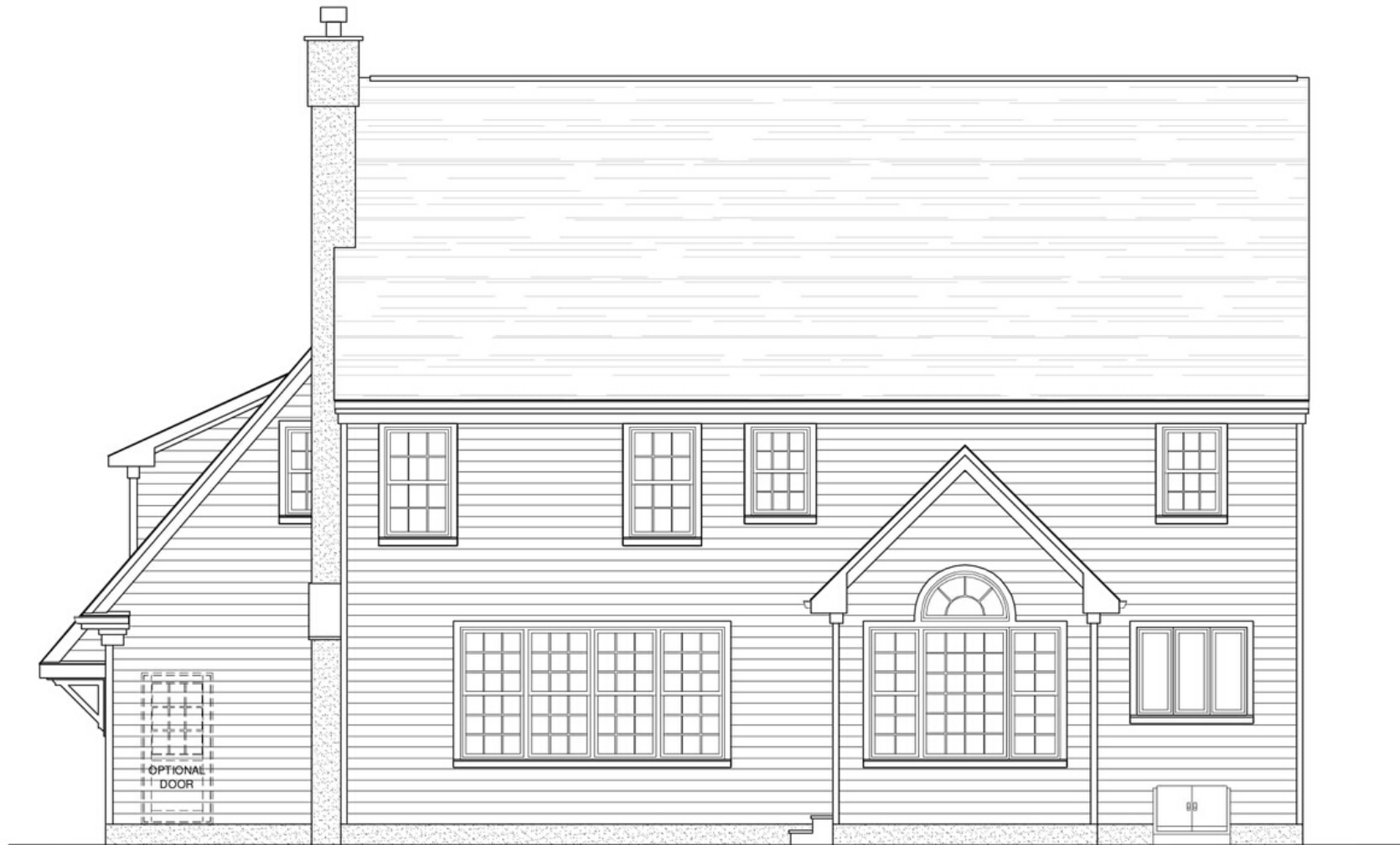
FARMHOUSE - REAR ELEVATION