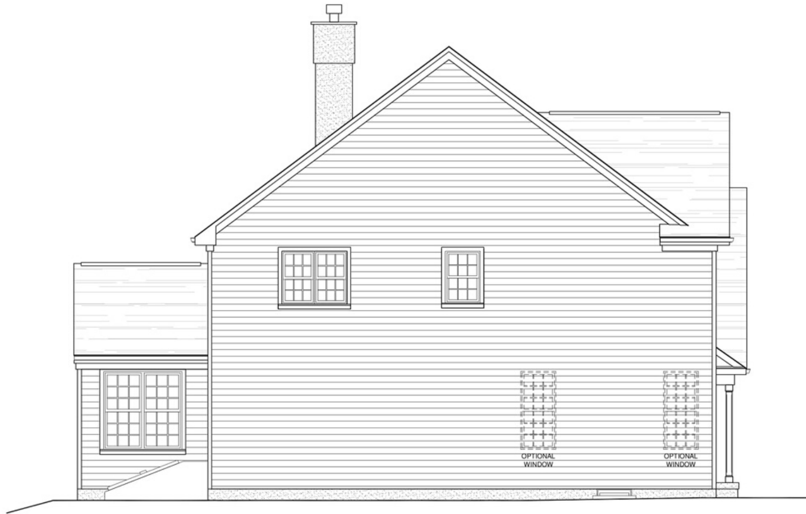
FARMHOUSE - LEFT SIDE