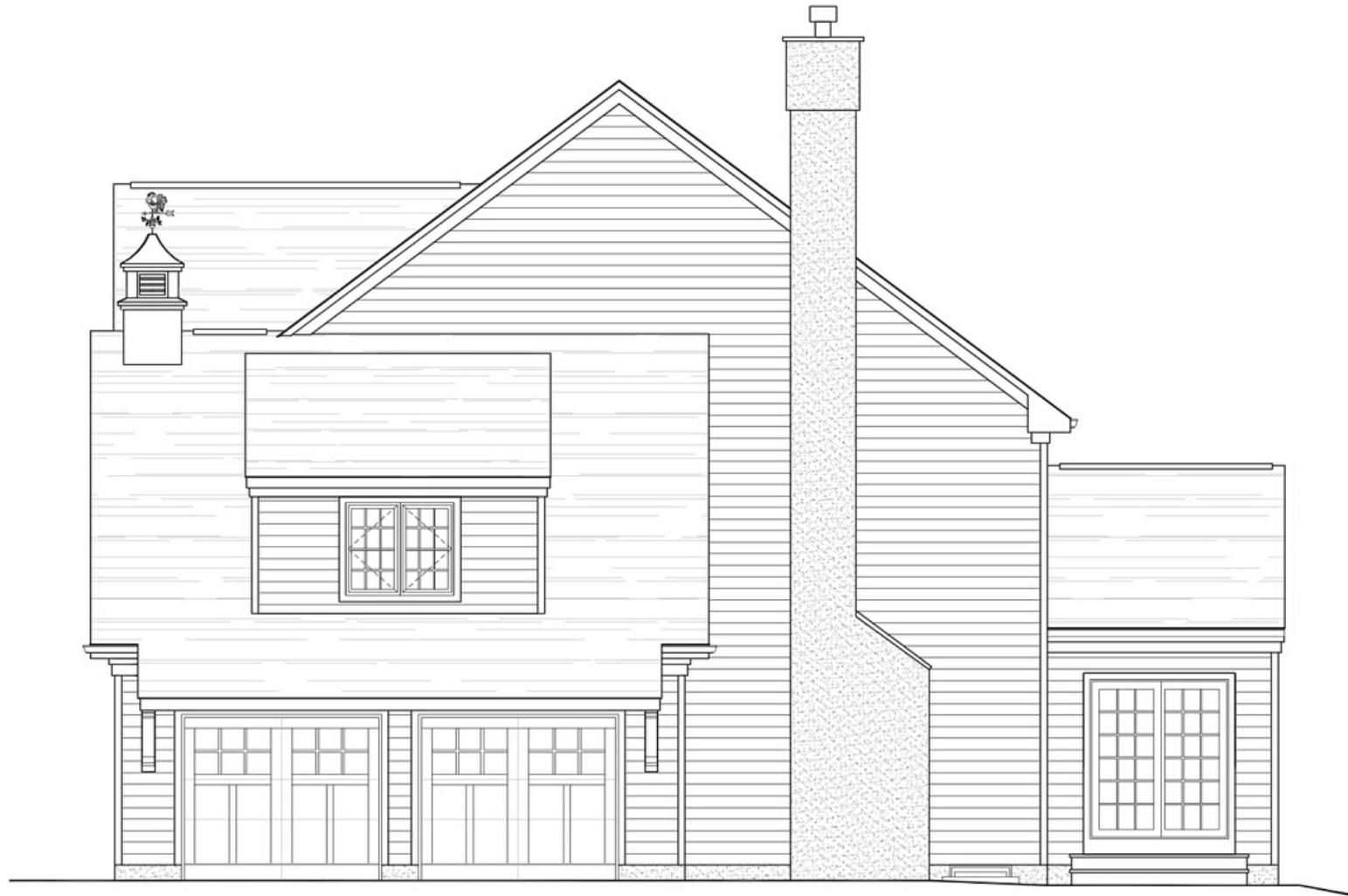
FARMHOUSE - RIGHT SIDE